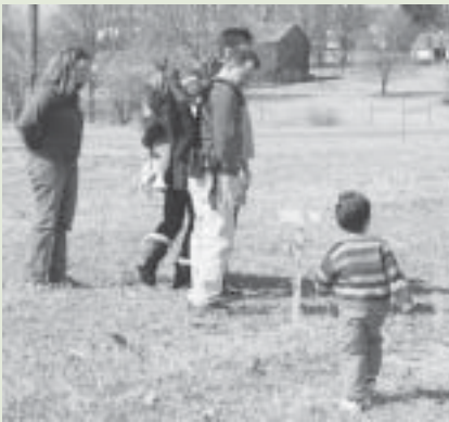
A Prayer Walk on the land for our new facility